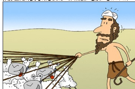
THE GOOD SHEPHERD TAKES THE FLOCK OUT FOR A WALK