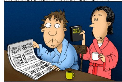
WHY DON'T YOU STOP WONDERING WHAT'S WRONG WITH THE WORLD AND READ THE MANUAL